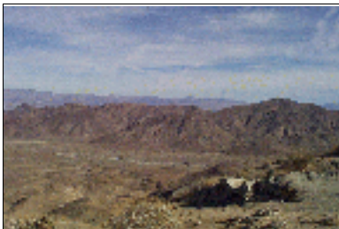
State Route 74, near Pinyon Flats

Many roadway corridors in Riverside County traverse its scenic resources. Enhancing aesthetic experiences for residents and visitors to the County promotes tourism, which is important to the County’s overall economic future. Enhancement and preservation of the County’s scenic resources will require careful application of scenic highway standards along Official Scenic Routes.