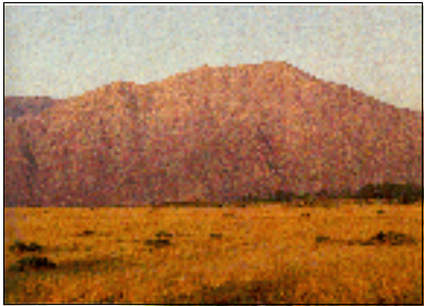
Mt. San Jacinto