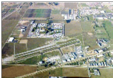
An aerial view of the Hemet Ryan Airport

Four policy areas have been designated within the Harvest Valley/Winchester planning area. They are important locales that have special significance to the residents of this part of the County, or will have when their development potential is realized. Many of these policies derive from citizen involvement over a period of years in planning for the future of this area. In some ways, these policies are even more critical to the sustained character of the Harvest Valley/Winchester planning area than some of the basic land use policies because they reflect deeply held beliefs about the kind of place this is and should remain. These boundaries are only approximate and may be interpreted more precisely as decisions are called for in these areas. This flexibility, then, calls for considerable sensitivity in determining where conditions related to the policies actually exist, once a focused analysis is undertaken on a proposed development project.