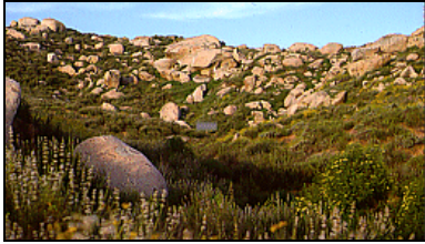
A view of the outstanding open space in the Motte-Rimrock Reserve.