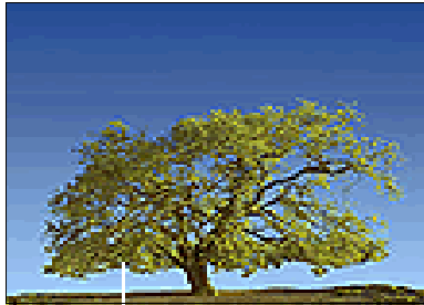
A typical oak tree.