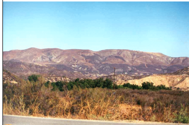
A scenic vista along State Route 79