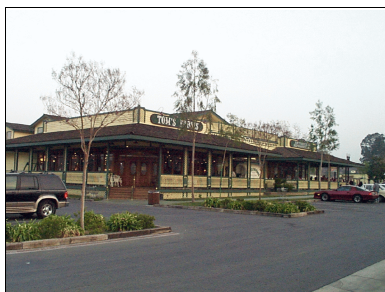
Tom's Farms Retail Area