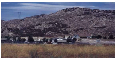
The Lakeview Mountains provide a backdrop for the community.

Juniper Flats is a rural residential community tucked away among the boulders in the Lakeview Mountains. This small rural, equestrian-oriented community consists of single family homes on large lots. Juniper Flats Road, a windy two-lane road, provides the only all weather access through this community.