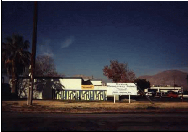
The Nuview Elementary School.

The community of Nuevo is located between the San Jacinto River on the east and the foothills of the Lakeview Mountains on the west. Nuevo Road and Lakeview Avenue are the major streets within this community. Nuevo is a rural to semi-rural residential community with an equestrian focus. While there are some smaller parcels, the vast majority of lots are typically between one-half and two acres in size. The community of Nuevo is anchored by a small neighborhood village located at the intersection of Lakeview Avenue and Nuevo Road. This village includes local serving commercial uses, a school, a ballfield, and a church. Surrounding the village are some of the smaller residential lots in the area. In the area north of Nuevo Road is a fire station, post office, school, and a number of private equestrian facilities.