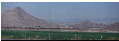
A row of trees at the base of the Bernasconi Hills delineates the San Jacinto River.

Three policy areas have been designated within the Lakeview/Nuevo planning area. In some ways, these policies are even more critical to the sustained character of the Lakeview/Nuevo planning area than some of the basic land use policies because they reflect deeply held beliefs about the kind of place this is and should remain. These boundaries are only approximate and may be interpreted more precisely as decisions are called for in these areas. This flexibility, then, calls for considerable sensitivity in determining where conditions related to the policies actually exist, once a focused analysis is undertaken on a proposed development project.