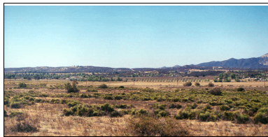
The Anza Valley

Anza is a large-lot rural residential community along State Route 371 with commercial services along the highway serving area residents and the traveling public. The community is also served by its own school and post office. Minimal utilities and services are available in the community.